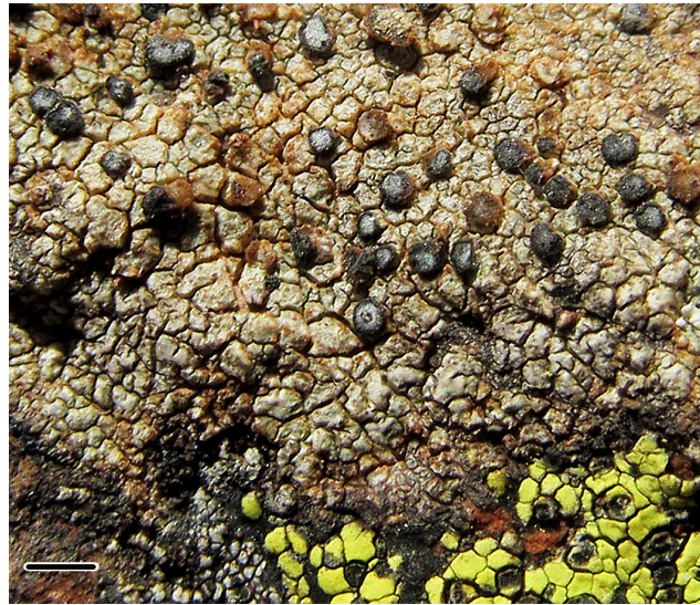
Fig. 2. Sarcogyne sekikaica (holotype). Scale: 1 mm.